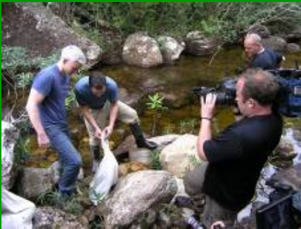
Anderson Cooper and Jeff Corwin during filming the documentary in Cambodia, as part of the "Planet in Peril" series.

CNN's biggest environmental series ever, "Planet in Peril" airs globally this month, featuring PeunPa at work, together with wildlife law enforcement officers from Thailand and Cambodia who are trying to stop massive wildlife poaching and illegal logging under the new ASEAN Wildlife Enforcement Network. Celebrity correspondents Andersen Cooper and Jeff Corwin examine the problems of climate change, vanishing habitats, disappearing species and human population growth around the world. They stop off from their worldwide tour in Southeast Asia to follow PeunPa staff, Thai Police and Cambodian rangers to track down poachers and wildlife traffickers from the jungles to the black markets along the borders. Watch "Planet in Peril" on CNN on October 24 and 25 at 9am, Bangkok Time. The program will be rerun on October 24 at 8pm and October 25 at 2am. For more information, see http://www.cnn.com/SPECIALS/2007/planet.in.peril/ .