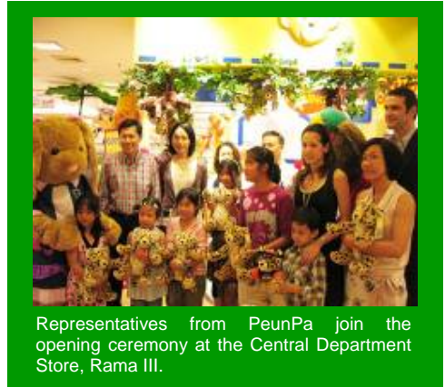
Representatives from PeunPa join the opening ceremony at the Central Department Store, Rama III.

PeunPa would like to express sincere thanks to Central Department Store Co., Ltd. for supporting our efforts to protect Thailand's wildlife and natural habitats.