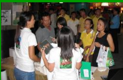
PeunPa's exhibition booth attracted people to learn more about wildlife conservation

Bangkok's massive Impact Arena was the site of "Retree Music Festival" attracting thousands of young and old music and nature lovers on September 13 and 14. PeunPa staff set up a forest education booth near the entrance of the concert where most visitors had the opportunity to learn about PeunPa's work to stop the illegal wildlife trade and protect Khao Yai National Park. PeunPa's display included the results of wildlife research in Khao Yai (now a world heritage site), including pictures of wild animals taken by secret camera traps. The exhibit also featured large colorful banners of our "Sold Out" public awareness campaign. TV monitors also ran PeunPa's TV commercials about the illegal wildlife trade, presented by nine Thai celebrities encouraging consumers not to buy endangered species.